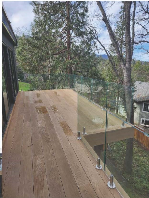
1/2" Clear Tempered Glass Railing