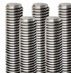
All Thread rod

Nozzles Brushes Screens Carbide Bits Rebar Cutters