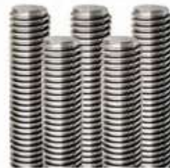
All Thread rod A307 & F1554 Gr36 in stock