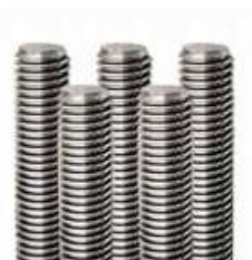
All Thread rod