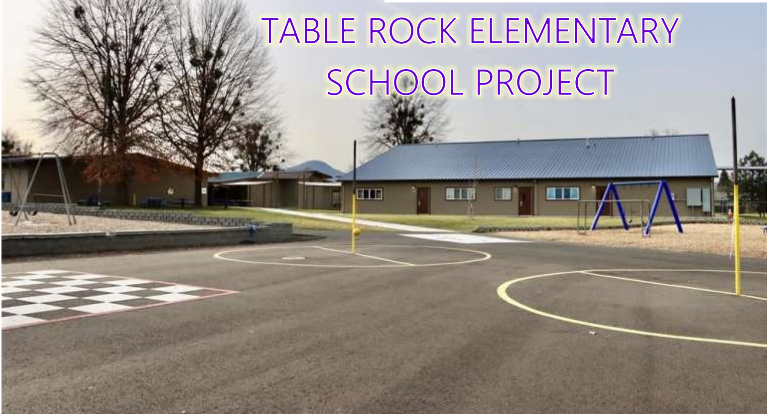
TABLE ROCK ELEMENTARY SCHOOL PROJECT

EAGLE POINT — SCHOOL DISTRICT 9 — Every Student - Every Class - Every Day!