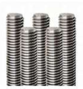
All Thread rod A307 & F1554 Gr36 in stock