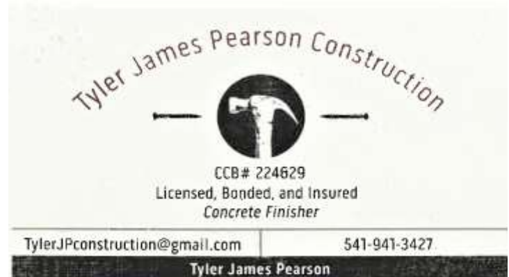
Table Rock Elementary School Project

Description: The general scope of the project includes: Construction of a 60x30 open steel replacement building and associated demolition Remodel to provide for drive through clinic access Interior remodel for emergency storage and operations Construction of interior storage mezzanine Installation of 400 amp electric service (underground) and back up generator.