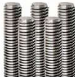
All Thread rod