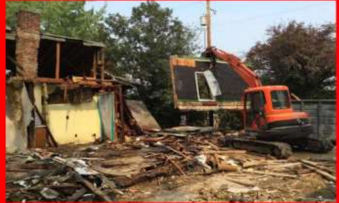
Lot Scrapes & Demolitions