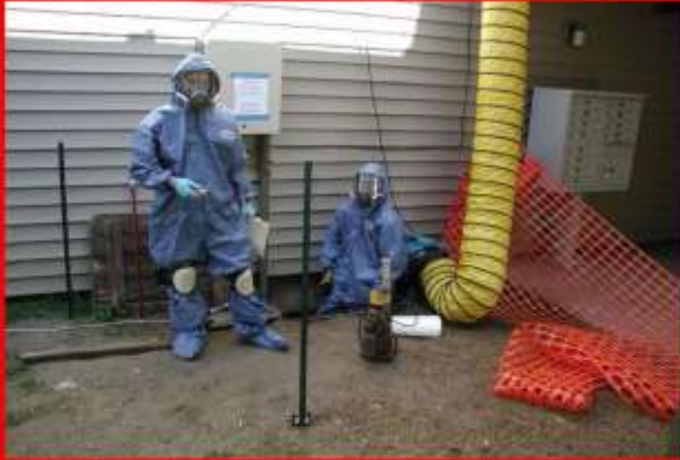
Residential & Commercial Testing / Abatements