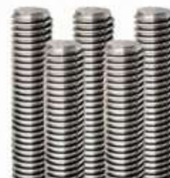
All Thread rod