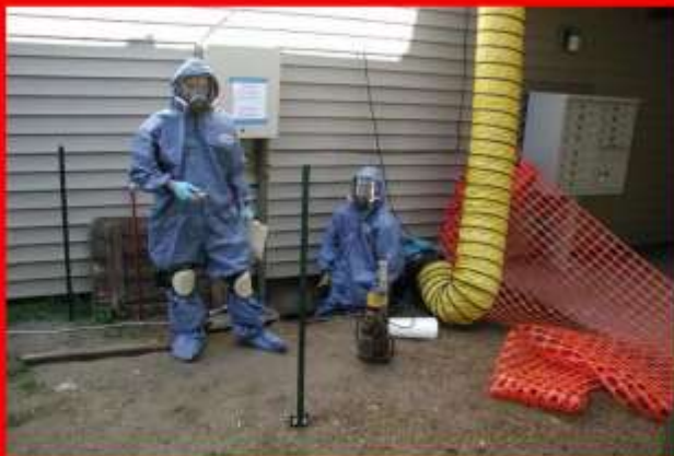
Residential & Commercial Testing / Abatements