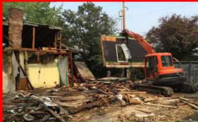
Lot Scrapes & Demolitions